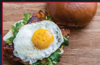
BACON AND EGG BREAKFAST SANDWICH