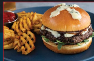
BLUE CHEESE BACON BURGER